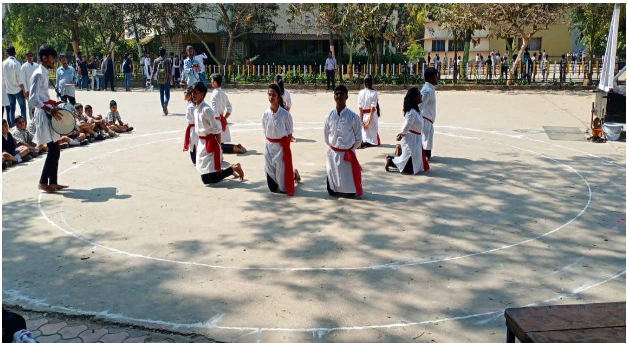
Street Play Competition