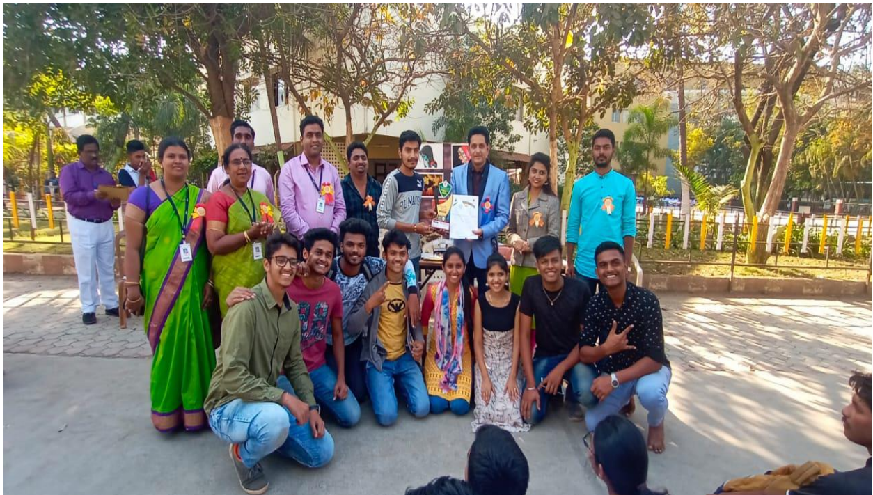
Winners of Street Play Competition