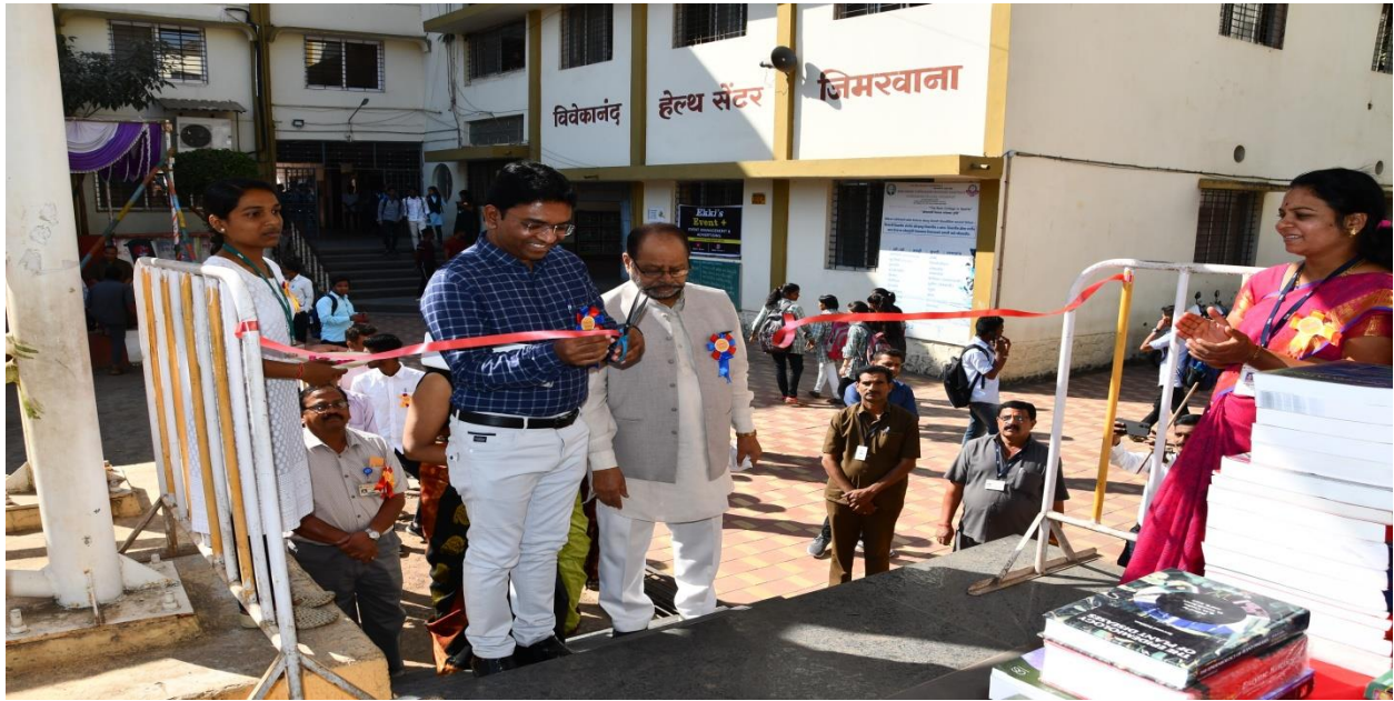
Inauguration of Book Exhibition