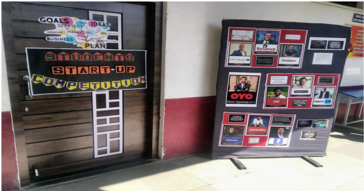
Students' Startup Competition