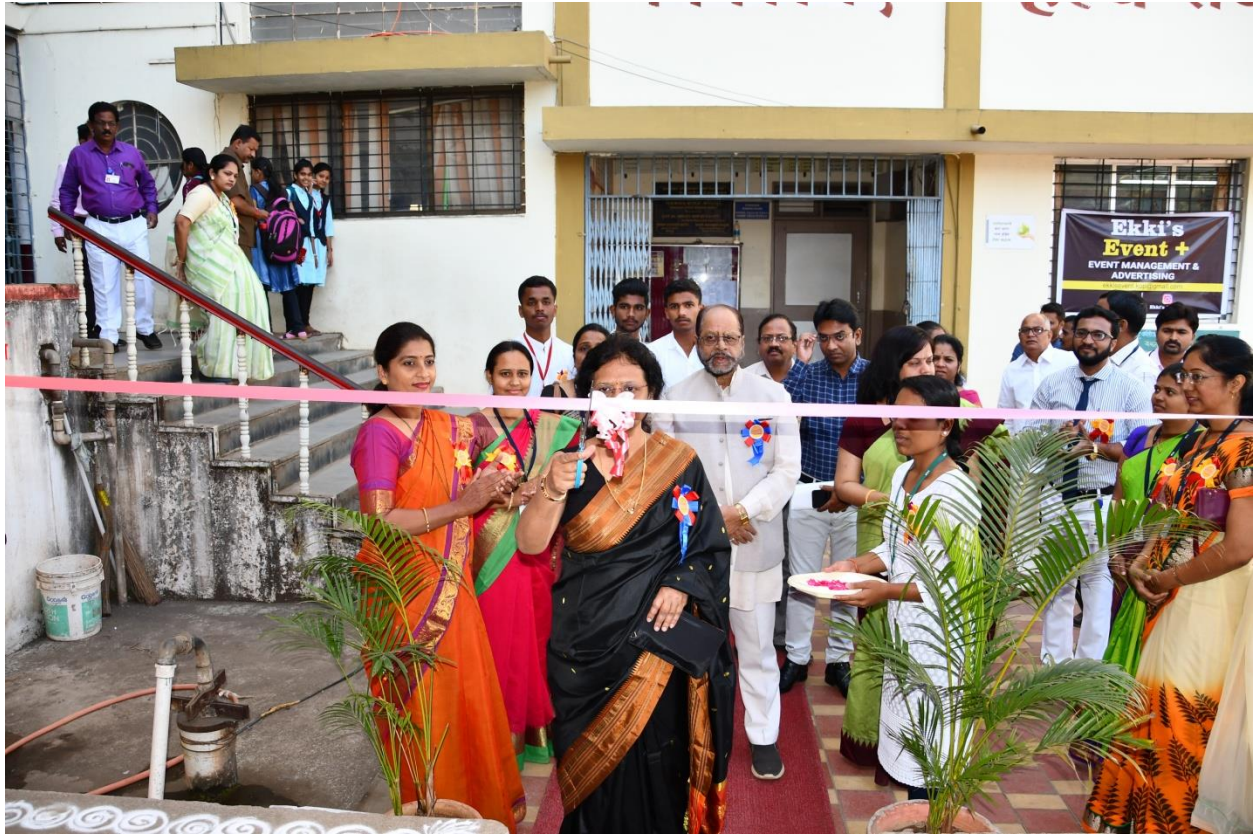
Inauguration of Food Fair